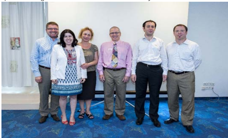
Speakers from Milliman and organisers of the EAA and of the Croatian actuarial association.

available at www.actuarial-academy.com . The early-bird registration fee is € 870 plus 23 percent VAT until September 20. After this date the fee will be € 970 plus VAT. Register now and benefit from the early-bird fee! The book can be ordered here .