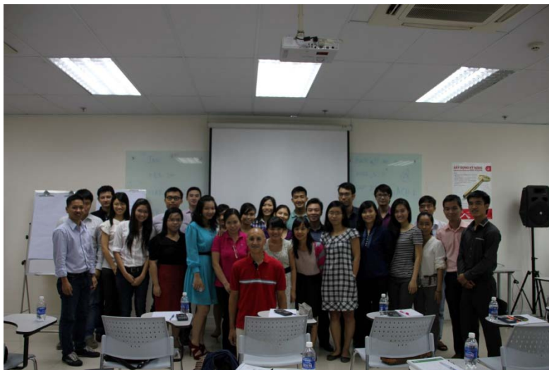
Students and professors at the introductory course in Vietnam