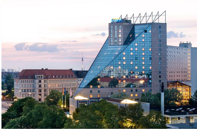
ESTREL Convention Center