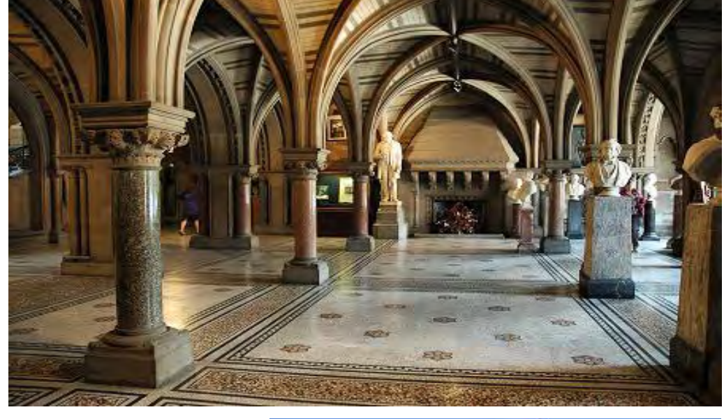
Sunday 13 July Welcome Reception – Manchester Town Hall